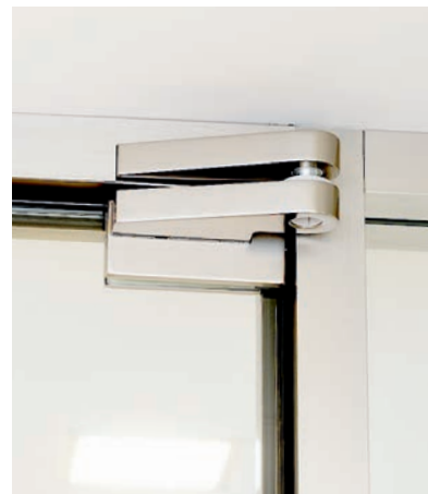
EA offset fittings