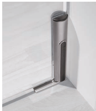
BEYOND swing door system