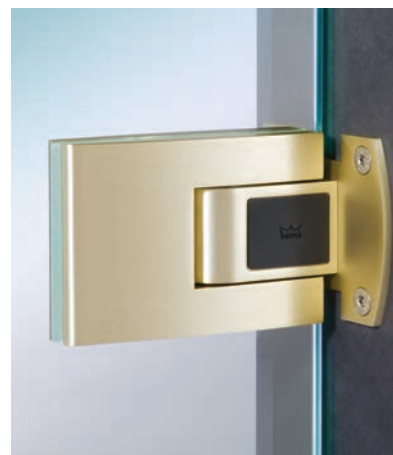
TENSOR double-acting hinge