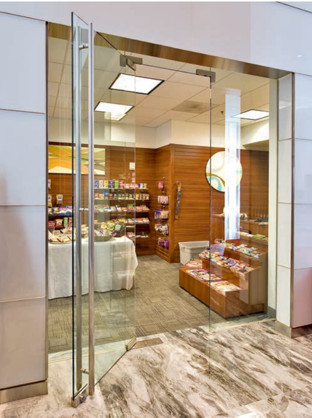
BTS80 floor-concealed door closer