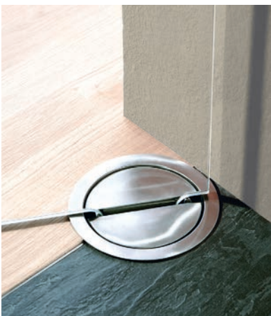
VISUR double-acting pivot

The sophisticated VISUR double-acting pivot system makes it possible to create all glass double-acting doors without any visible fittings. All hardware components are located in the surrounding structures of the door panel.