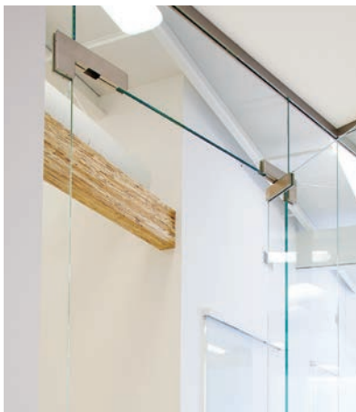
Universal patch fittings

With its broad range of options and configurations, Universal patch fittings are ideal for almost any design. Tempered glass assemblies are provided with fixed parts in a variety of arrangements—with corner fittings or fin fittings at different angles, and with double- or single-acting doors in single- or double-door designs. Universal fittings are supplied standard with gaskets to suit 3/8" (10) and 1/2" (12) glass.