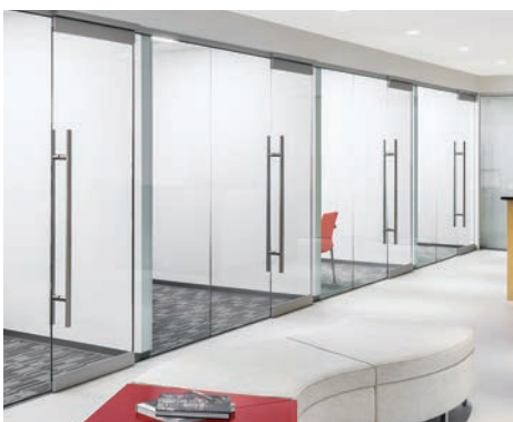
TG 9387 handles