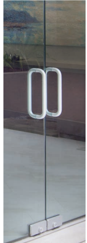
Economy series handles