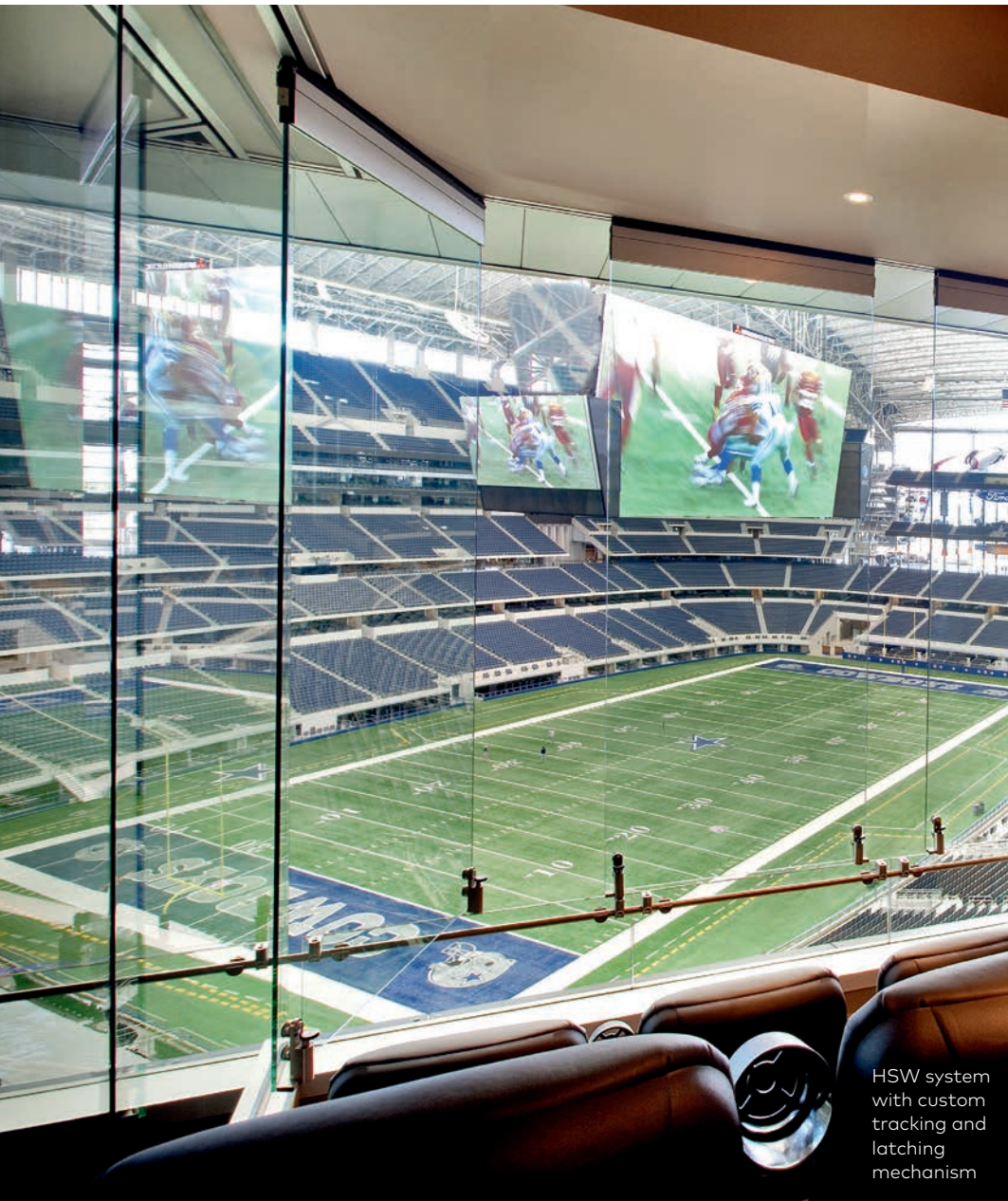
HSW system with custom tracking and latching mechanism

The track can be arranged in a variety of configurations, and sliding panels can be moved without using floor guides or channels. Bolts and locks secure each sliding panel in position and the panels are easy to adjust, align, and operate.