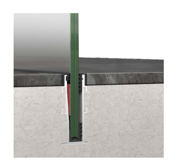
M8210 in-floor, with 8+8mm and 10+10mm glass