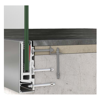
M8202 side-mounted, with 8+8mm and 10+10mm glass