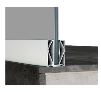
M8200 on-floor, with 8+8mm and 10+10mm glass