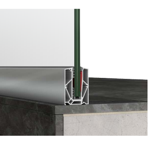
M8207 on-floor, with 8+8mm and 10+10mm glass