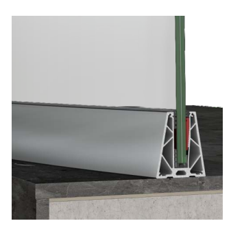
M8208 on-floor and curved, with 8+8mm and 10+10mm glass